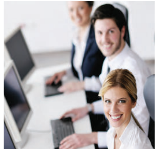
Attentive customer care