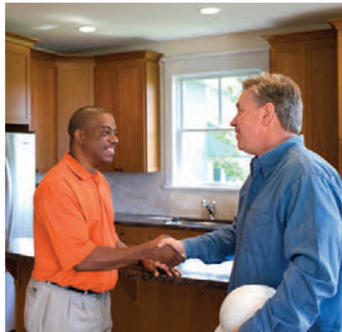
Experienced sales support