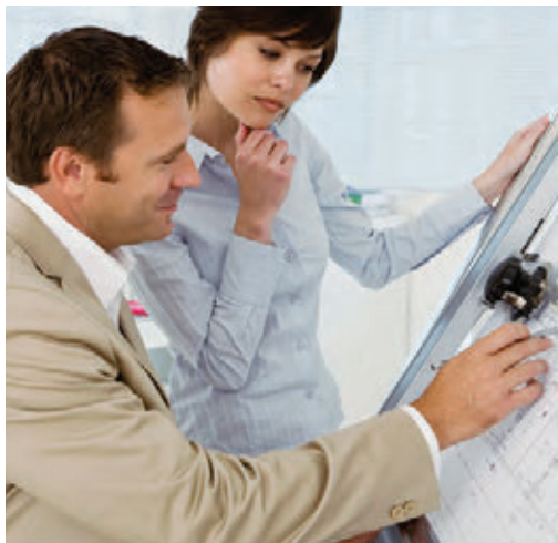
Skilled design service

“Our programs are based on a solid foundation of leadership and vision to provide better service, higher quality and more innovation than our competitors.”